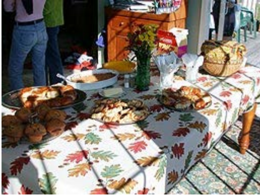
...and these were just the appetizers!